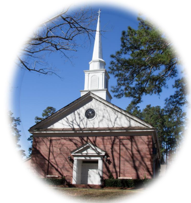
First Presbyterian Church Whiteville, NC

“I sought the LORD, and he answered me, and delivered me from all my fears. Look to him, and be radiant; so your faces shall never be ashamed. This poor soul cried, and was heard by the LORD, and was saved from every trouble. The angel of the LORD encamps around those who fear him, and delivers them. O taste and see that the LORD is good; happy are those who take refuge in him.”