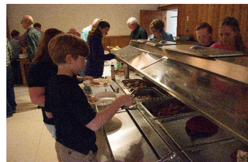
October Family Night Supper – Fish Fry October 23, 2019